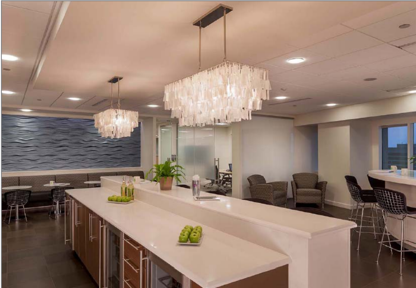
Coffee Point / Break Room